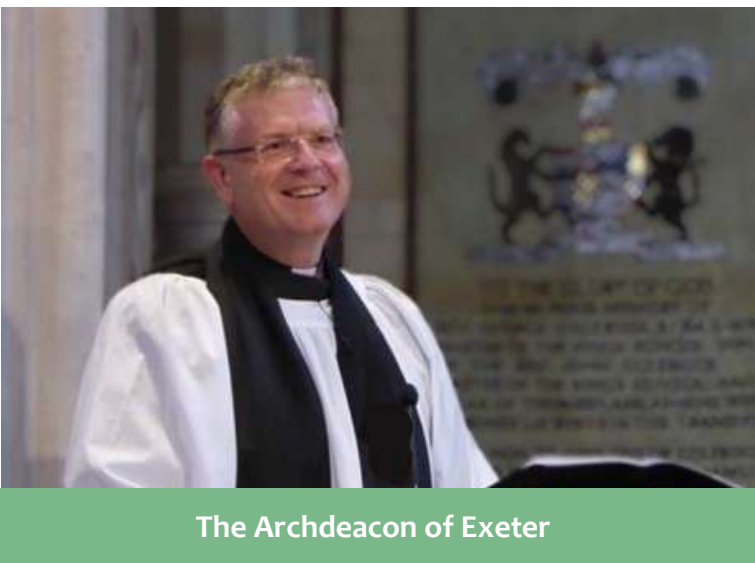
The Archdeacon of Exeter